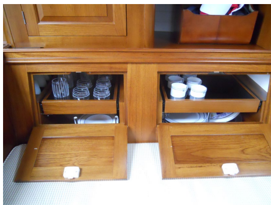
Custom dish storage

HARMONY has been described as the perfect boat for “8 to sail; 6 to eat; 2 to sleep.” While HARMONY is intended to accommodate a couple for an overnight, the settees are long and wide to sleep additional friends or family. There is a flat screen with DVD player in the salon, and an interior/exterior audio system with sat radio and ipod hook up. The galley incorporates a deep refrigerator, microwave, two-burner propane stove, and gourmet espresso maker. There is custom storage for wine in a locker as well as the fridge, and a custom varnished teak knife rack. The head features a fresh water, electric flushing head, shower, and full-length mirror.