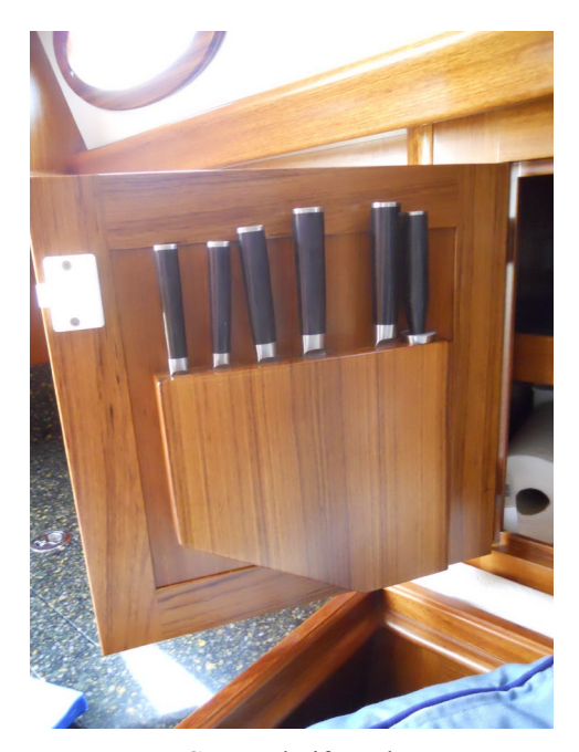
Custom knife rack