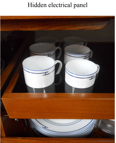
Custom dish storage