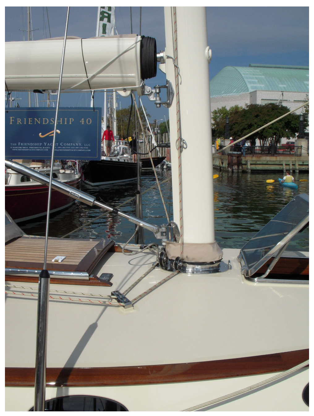
Stainless steel hydraulic vang, in-boom main furler, and mast collar with custom built-in stainless steel turning blocks.