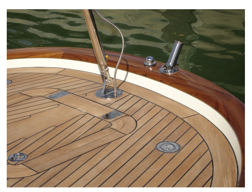
Aft deck – custom flag socket for dinghy towing, stainless steel hydraulic backstay, and flush plate for fresh water hot/cold deck shower

The foredeck houses two flush lockers – to port is the swing out anchor system with Lewmar electric windlass and saltwater wash down, to starboard is the chain locker with storage for swim ladder and dinghy outboard motor. The custom chocks in the cap rail are larger on the foredeck than those aft to accommodate large mooring lines, and the cleats are flush to the deck when not in use. On centerline is an additional, extra strength pop-up pad eye for hurricane tie down.