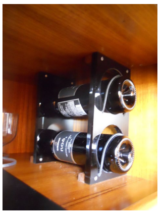
One of three wine storage racks