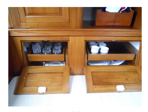
Custom dish storage

SOONER SCHOONER has been described as the perfect boat for "8 to sail; 6 to eat; 2 to sleep." While SOONER SCHOONER is intended to accommodate a couple for an overnight, the settees are long and wide to sleep additional friends or family. There is a flat screen with DVD player in the salon, and an interior/exterior audio system with sat radio and ipod hook up. The galley incorporates a deep refrigerator, microwave, two-burner propane stove, and gourmet espresso maker. There is custom storage for wine in a locker as well as the fridge, and a custom varnished teak knife rack. The head features a fresh water, electric flushing head, shower, and full-length mirror.