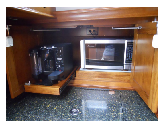
Pull-out shelf for espresso machine